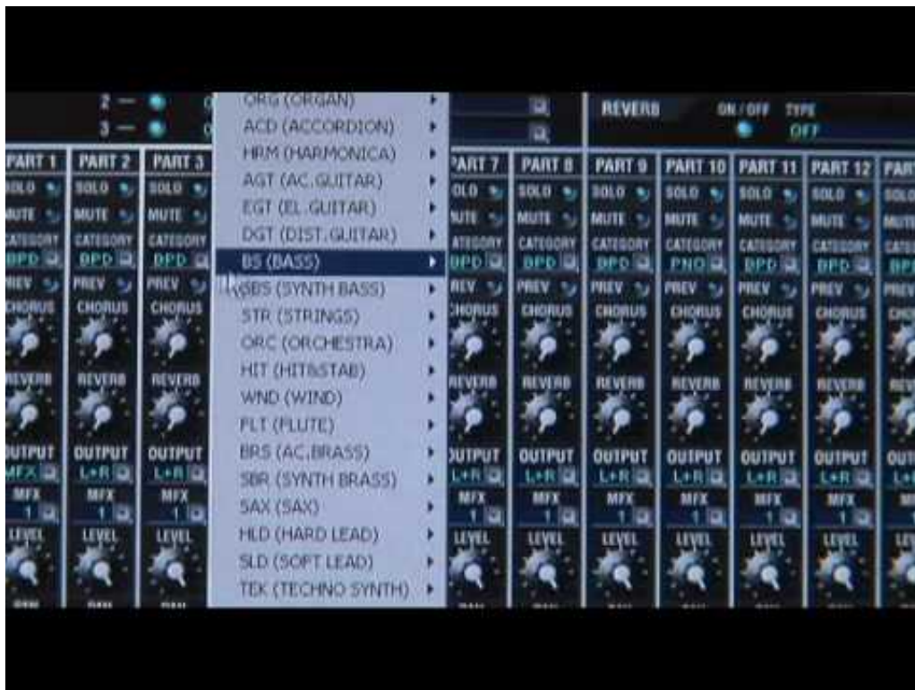
Roland Sonic Cell Patch